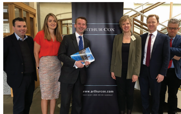
With other speakers at TCD Law School/Arthur Cox Employment Law update, June 2019

In September 2018, the Gender Pay Gap bill that I had introduced in the Seanad in May 2017 was passed through the Seanad. Labour TDs tabled the Bill before the Dáil where it passed Second Stage on 3 October 2018. My bill would require all companies with 50 or more staff to publish anonymised data showing pay levels and gender breakdown in their organisations, in order to see if a gender pay gap exists. The bill would then empower the Human Rights and Equality Commission to take action against companies which pay men more than women. Overall, women in Ireland earn on average 14% less than men. Laws that require wage transparency have reduced the gap between the earnings of women and men in other countries. The government have now introduced their own legislation to tackle the gender pay gap, currently before the Oireachtas – if passed, it will mean that we can finally have transparency on the real gender pay gap in Ireland.