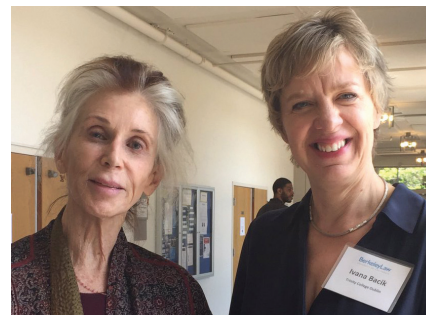
With Professor Catharine MacKinnon at the Worldwide #MeToo Movement Conference on Global Resistance to Sexual Harassment at the University of California, Berkeley, at which I was a speaker, May 2019

On 28 November 2019 I spoke at the 30 year anniversary of Ruhama, the frontline organisation working with women in prostitution. In March 2019, I spoke to mark the second anniversary of the introduction of Part 4 of the Criminal Law (Sexual Offences) Act 2017 which criminalised the purchase of sexual services, at the launch by the Immigrant Council of Ireland of the cross-jurisdictional ASSIST programme, funded under the EU Asylum, Migration and Integration Fund. At the launch, I emphasised that the 2017 law reform is based on an understanding of prostitution itself as an exploitative 'gender regime'. I will be working with a group of Oireachtas members, NGOs and others over coming months to promote the 2017 law reform and highlight its importance in tackling demand for prostitution.