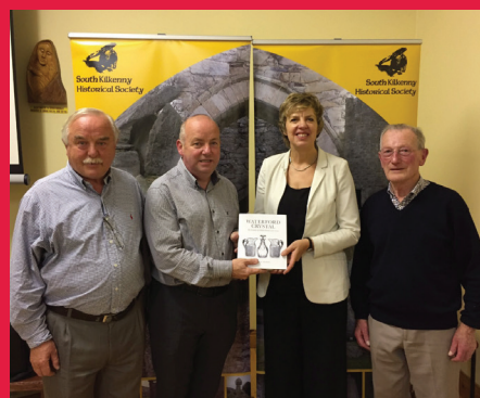
I was delighted to speak at the South Kilkenny Historical Society in Mullinavat, 26 September 2019 about my family's links to the area, and in particular my grandfather's role in re-establishing Waterford Glass