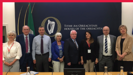
Pictured with other members of the Committee of Foreign Affairs, and international trade unionists, at a meeting on the Colombian Peace Process, 11 July 2019