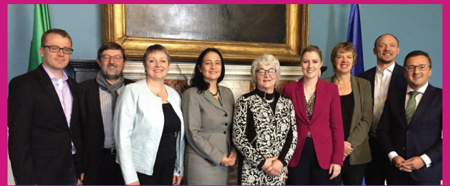
With members of the all-party Oireachtas Women's Caucus, 10 October 2019

I am proud to be on the Executive of the Oireachtas Women's Caucus (chaired by Catherine Martin TD), which was established in 2016. Among our other achievements, we held a very successful international conference of women's caucuses in Dublin Castle in September 2018, attended by women parliamentarians from across the world. In March 2019, we put forward a cross-party motion in both Dáil and Seanad on Period Poverty, drawing attention to the very serious implications of period poverty for girls and women, both in Ireland and internationally. Drawing on the brilliant work of NGOs like Homeless Period and Plan International, we raised awareness about the lack of affordability of sanitary products; and also challenged the taboo traditionally impeding public discourse about women's menstruation.