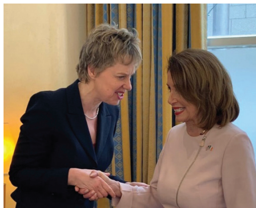
With Speaker Nancy Pelosi at her visit to the Houses of the Oireachtas as part of Dáil 100, April 2019